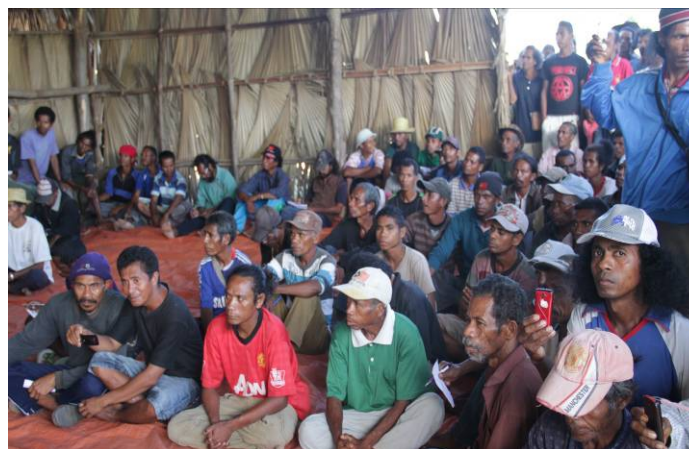
Meeting between CPD-RDTL and Government representatives

In relation to the police blockade in Faturberlihu, the CPD-RDTL Coordinator approached the President of the Republic and requested that the President halt police activities. However the meeting did not bring any resolution, and the President of the Republic proposed to the CPD-RDTL to meet with Vice-Prime Minister (Timor Post 13/3/2013). The Vice-Prime Minister informed that, the government resolution had already mandated the PNTL to facilitate the return of CPD-RDTL members to their home districts. The resolution also stated that the government had prepared funding to purchase the rice production from the CPD-RDTL activities in Faturberlihu. The government was also prepared to support future CPD-RDTL-led