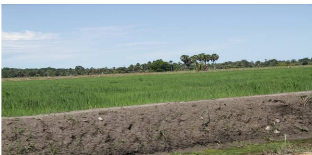
Land Farmed by CPD-RDTL in Fatuberlihu, Manufahi