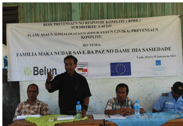
Conflict Prevention Seminar led by the CPRN in Laclo, Manatuto