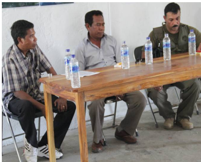
Meeting between Minister for Commerce, Industry and Cooperative, Vice Prime Minister and PNTL General Commander with CPD-RDTL

During the period November 2012 - February 2013, the 'Conselho Popular do Defesa da Republica Democratica de Timor-Leste' (CPD-RDTL) movement gathered in Suku Welaluhu , Fatuberlihu sub-district, Manufahi to conduct cooperative farming activities. However the presence of CPD-RDTL and concentration of its members continued to cause concern within the Fatuberlihu community and for the government. In response to the CPD-RDTL presence in the area, the Council of Ministers called upon the General Commander of PNTL to inform them about the latest situational developments in Welaluhu. The PNTL General Commander reported that the community members in Welaluhu were living under difficult and concerning circumstances (STL 26/2/2013). After receiving and analyzing reports from the PNTL General Commander and the Secretariat of State for Security, the Council of Ministers decided to publish a Resolution on 25 February 2013 to provide a mandate to PNTL to facilitate CPD-RDTL group members to return to